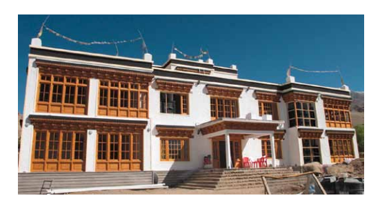
The Leh hostel, opening end 2012.

→ We continue our support of the innovative and ecological hostel in Leh. Thanks to solar heating it will be able to welcome Zanskari children from the isolated Himalayan valleys who are unable to return home in winter and provide them with schooling and vocational training. The people of Ladakh have welcomed this new low-cost heating system which removes the dangers of gas cylinders.